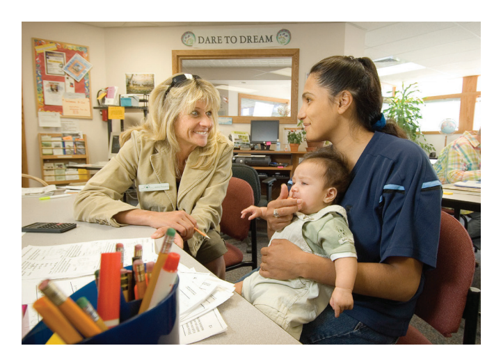
Adult Basic Education Program, Park County Community Foundation

Economic garden. A community foundation helps to build, grow, and manage assets that contribute to the sustainability of a community. Regardless of what happens to government funding or local employment opportunities, an endowment established by a community foundation is permanent and devoted to developing a thriving community. Not only does a community foundation focus on the present, but it is also structured to provide support beyond the lifetime of any of its founding members.