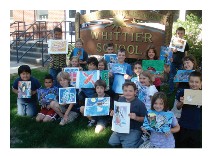
Bozeman Schools Foundation, Gallatin Valley Land Trust

Fundraising activities such as community dinners, annual donor campaigns, and silent auctions are beneficial in addressing operating expenditures such as marketing, events, staffing, office space and equipment, training, and professional services such legal, accounting and financial assistance. In contrast, asset development often comes in the form of planned gifts such as bequests, charitable gift annuities, real estate, commodities or livestock.