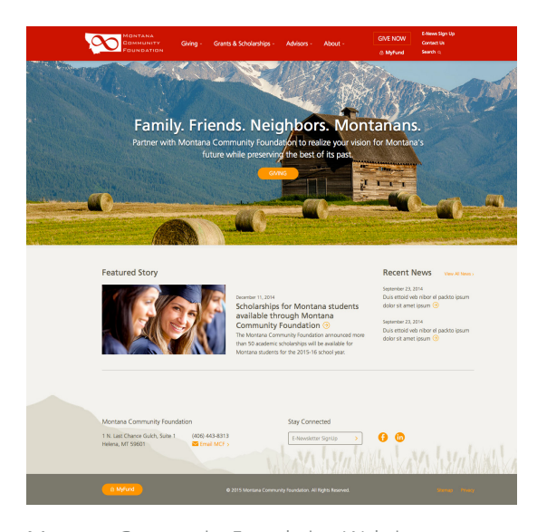
Montana Community Foundation Website www.mtcf.org