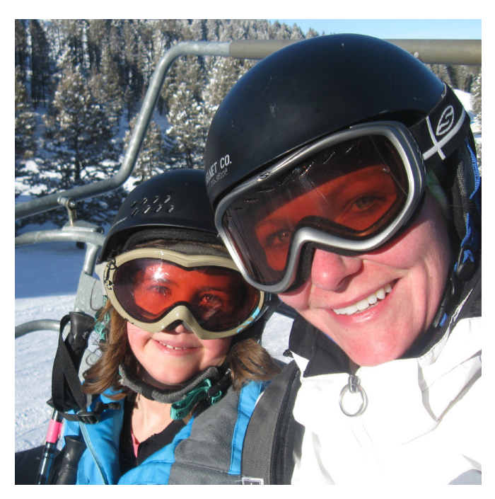
Big Brothers/Big Sisters of Gallatin County, Bozeman Area Community Foundation

Local community foundations wanting to become an affiliate should contact an established foundation. The umbrella foundation will likely provide your group its policies and procedures. This will outline the amount of funds required to open an account with the lead foundation as well as identify any fee structures.