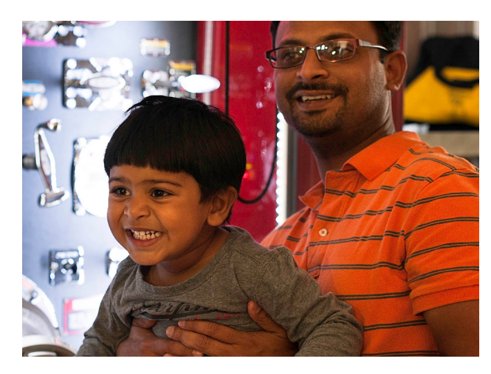
Thrive Dynamic Dads event, Bozeman Area Community Foundation

An endowment is frequently compared to a savings account that a community might establish for itself. Similarly, the earnings from unrestricted endowments can be used to fund community needs. Unlike a savings account, an endowment is never closed. The community cannot withdraw the initial deposit. An endowment is also different because it does not earn "simple interest." Instead, it is usually invested in stocks, bonds, or mutual funds to generate a higher return over a longer period of time.